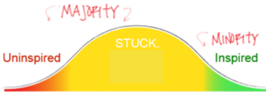
FIGURE: A profile of the global corporate sector:

Then there's the middle – a space where a company is neither fully inspired or uninspired. In the middle space, some companies are genuinely trying do the right thing. Others are only doing the right thing under duress or regulatory compliance. Both are pursuing profitable outcomes but neither are breaking through to the new C.E.O.s . This is where the majority of companies are today. To varying degrees these companies lack clarity about why they exist, what they stand for and their relationship to the rest of society. If we were asked to draw a picture of the status of the corporate sector, it would look like this: